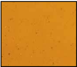
M265-2004 Honey Spice