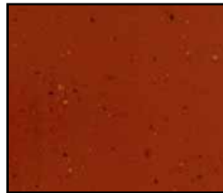
M265-2001 Dark Cherry