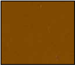
M265-2000 Raw Umber