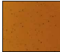
M265-2006 Light Oak