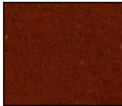
M265-2009 Burnt Umber