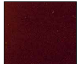
M265-2003 Dark Perfect Brown