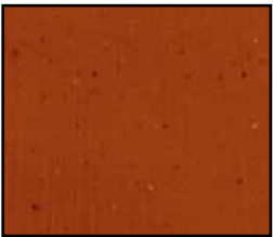
M265-2008 Dark Brown Mahogany